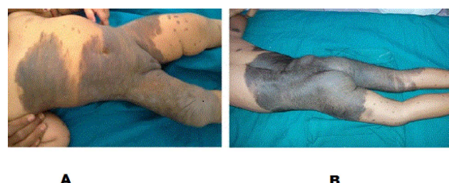
Figure 1: a) Hypertrichosis, lipoma b) Multiple satellite lesion.

An eight month old female child presented with complaints of large, asymptomatic, black, hairy pigmented lesion over the right part of chest & abdomen, whole of pelvic girdle, right lower limb up to knee, upper part of the left thigh and lower back, buttocks up to mid-thigh with multiple satellite lesions all over the body, few of them shows hypertrichosis and lipomatous lesion (Figure 1a and 1b). Multiple pigmented satellite lesions of 4-5 cm size were also present over the body also. The x-ray of pelvis showed right lower limb hypotrophy (Figure 2). No other loco motor abnormality was detected.