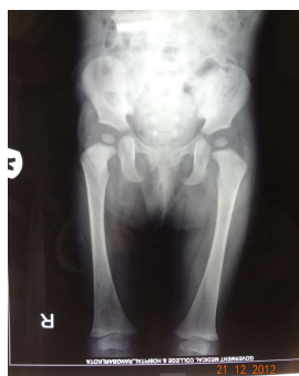
Figure 2: Right lower limb hypotrophy demonstrated on pelvic X-ray.