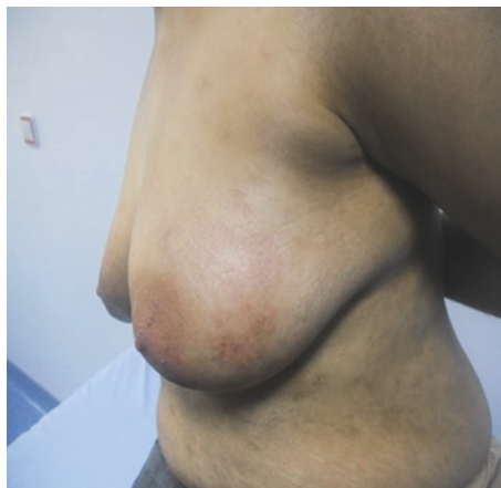
FIGURE 3: After treatment with 0.05% clobetasol propionate cream. Note the complete healing.