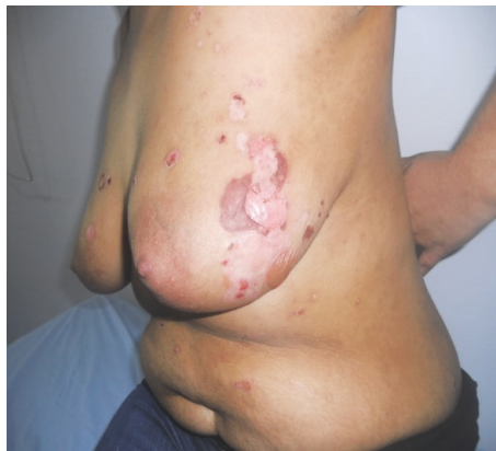
FIGURE 1: Clinical presentation of the patient; blisters, erosions, and remnants of blisters on her breasts and abdomen.

diagnosis. Histopathological examination showed subepidermal blisters with eosinophilic infiltration (Figure 2(a)) and in direct IF examination linear deposition of IgG along the basement membrane zone was observed. ELISA was positive for anti-BP180 antibody (47 U/mL). Also, BIOCHIP mosaic-based indirect IF test demonstrated a linear deposition of IgG along the basement membrane zone on the primate monkey esophagus, epidermal deposition on the salt-split skin substrate (Figure 2(b)), and anti-BP180 and anti-BP230 positivity on transfected EU90 cells.