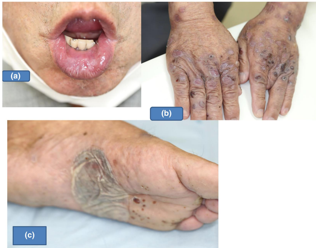
FIGURE 1 Clinical features (a) on the lips, (b) on the dorsal hands, and (c) soles