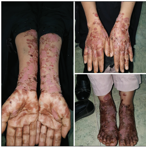
Figure 3: Clinical findings at the 7 th day follow-up. All lesions were in complete remission.

Palmoplantar involvement with vesiculobullous lesions may also represent the only feature of the disease (dyshidrosiform pemphigoid), or occur in association with other more typical widespread lesions. Localized forms of BP account for up to 30 percent of cases. Blisters involves the mucosa in up to a quarter of patients [8-11].