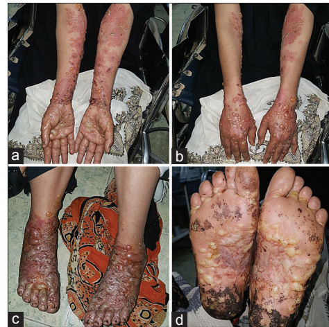
Figure 1: Clinical finding at the 1 st presentation. Rounded, tense, sub-epidermal blisters on erythematous bases are noted on (a) palms, skin flexures of the elbows and wrists, (b) dorsa of the hands, (c) dorsa of the feet, (d) and soles.

She was hospitalized, and the treatment regimen included oral 60 mg/day prednisolone as a starting dose (gradually tapered over the next 17 days), oral azithromycin 500 mg/day for 6 days, betamethasone-cloquinol containing topical cream (Betnovate-C™) thrice a day and pheniramine maleate injections (first-generation antihistamines) twice daily. Intravenous fluids, Vitamins A, E and C tablets and potassium permanganate as soaks (diluted as 1:1000) were prescribed as an adjuvant therapy.