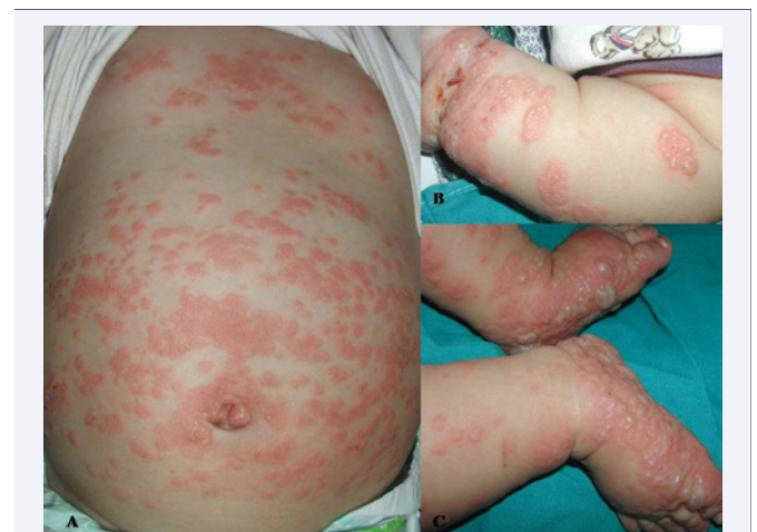
Figure 1 Multiple erythematous papules and plaques all over the anterior aspect of the trunk (A). vesiculo-bullous lesions all over erythematous skin localized on the upper (B) and lower extremities (C).

A healthy male infant, 3 months old, had developed papules and pustules initially on palms and soles, with progressive