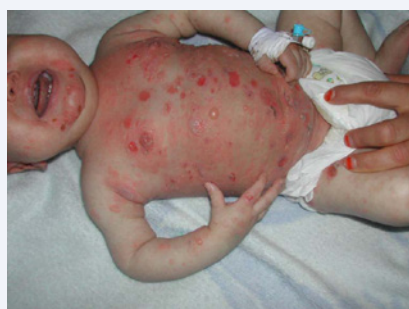
Figure 3 Diffuse papules, vesicles, bullae and erosions on the trunk, limbs and face.